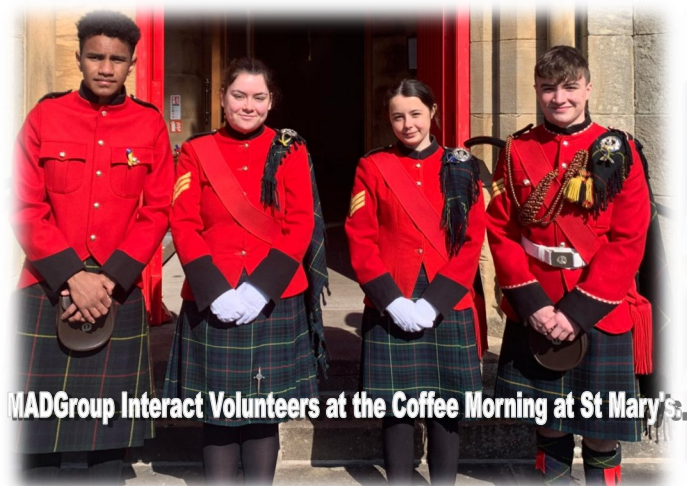
MADGroup Interact Volunteers at the Coffee Morning at St Mary's.