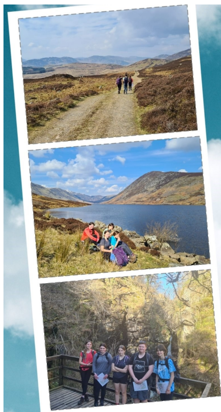
Senior Students out on Silver Duke Of Edinburgh Award expeditions