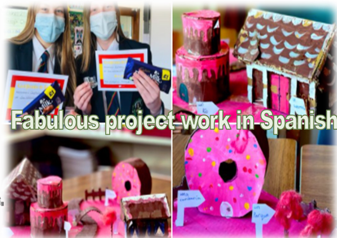
Fabulous project work in Spanish