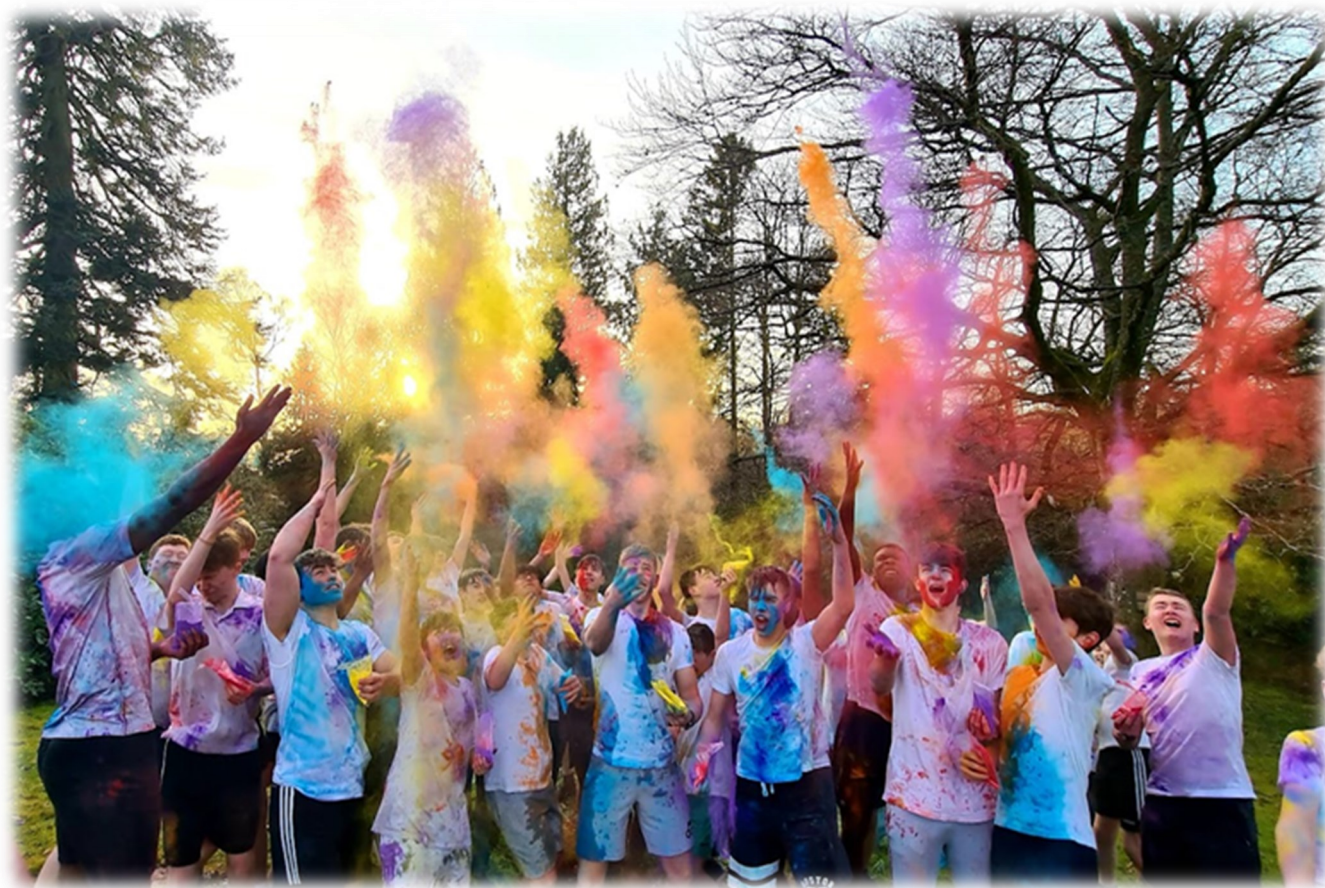
Holi party in Cunningham house