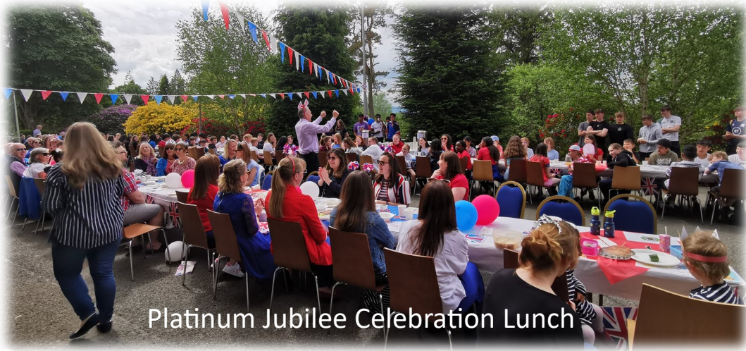
Platinum Jubilee Celebration Lunch