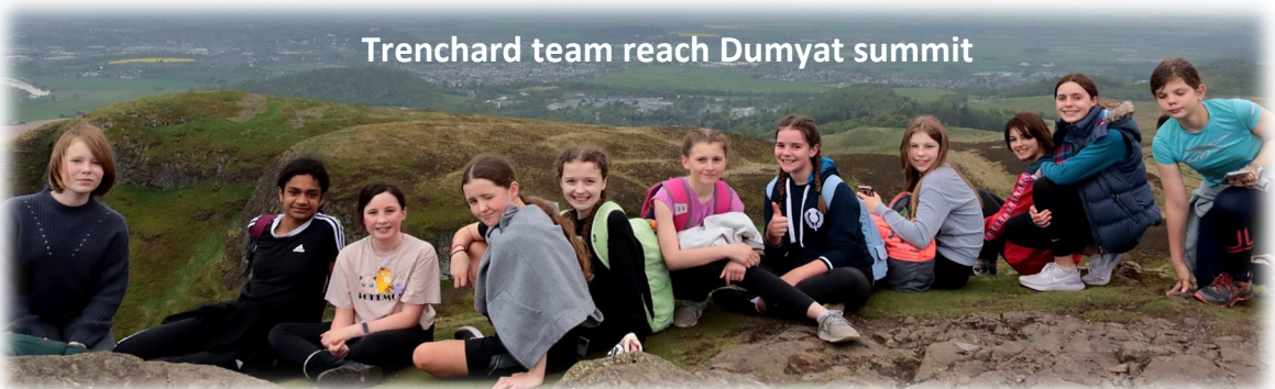
Trenchard team reach Dumyat summit