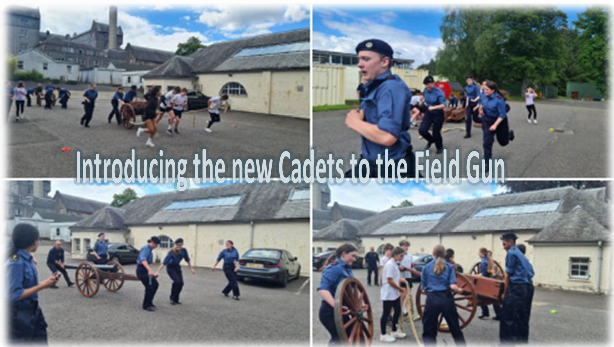
Introducing the new Cadets to the Field Gun