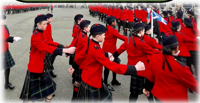
Battle of Waterloo Parade

All children should follow the normal signing out procedure at the end of term