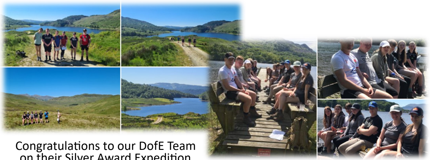
Congratulations to our DofE Team on their Silver Award Expedition