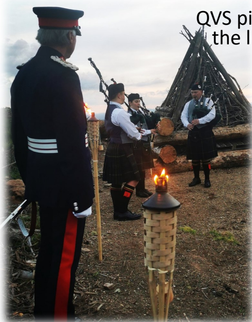
QVS pipers with the Lord Lieutenant for the lighting of the Jubilee Beacon at Kippendavie Estate.