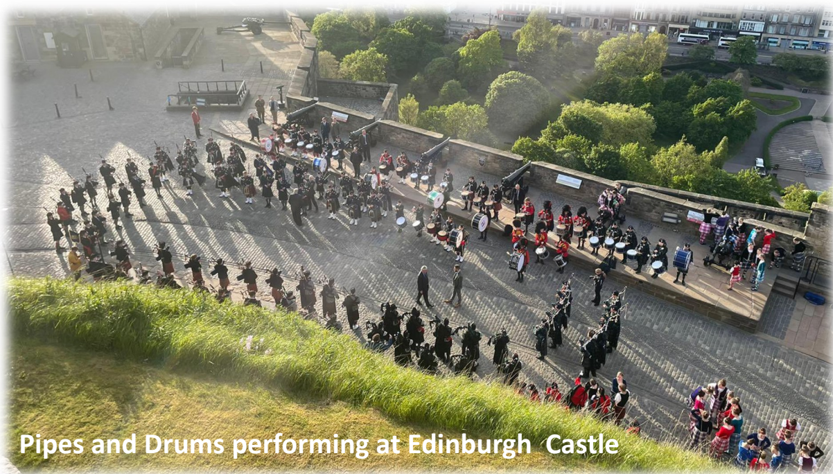
Pipes and Drums performing at Edinburgh Castle

Friday 16th to Friday 23rd December—Italy Ski trip