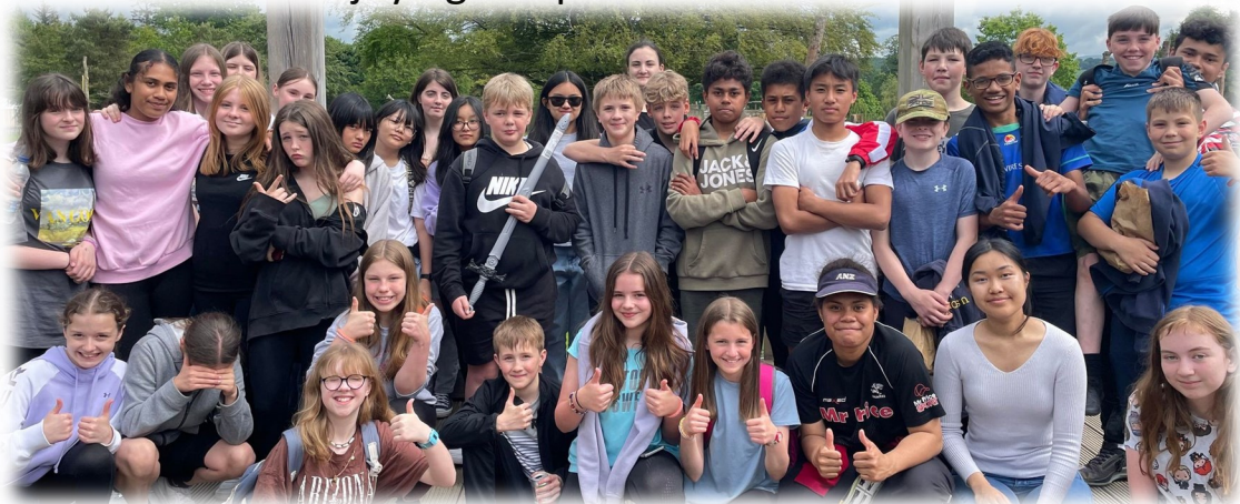
S1 enjoying a trip to the Safari Park