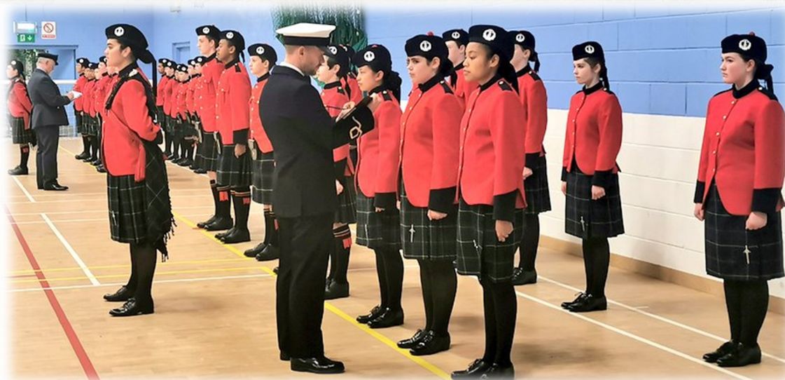
Drill and Turnout Competition