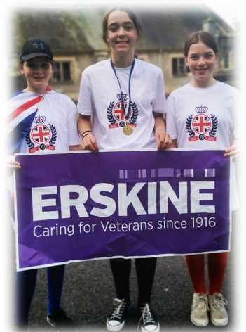
Raising funds for Erskine with our sponsored walk