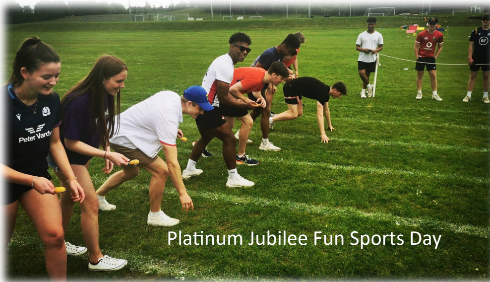
Platinum Jubilee Fun Sports Day