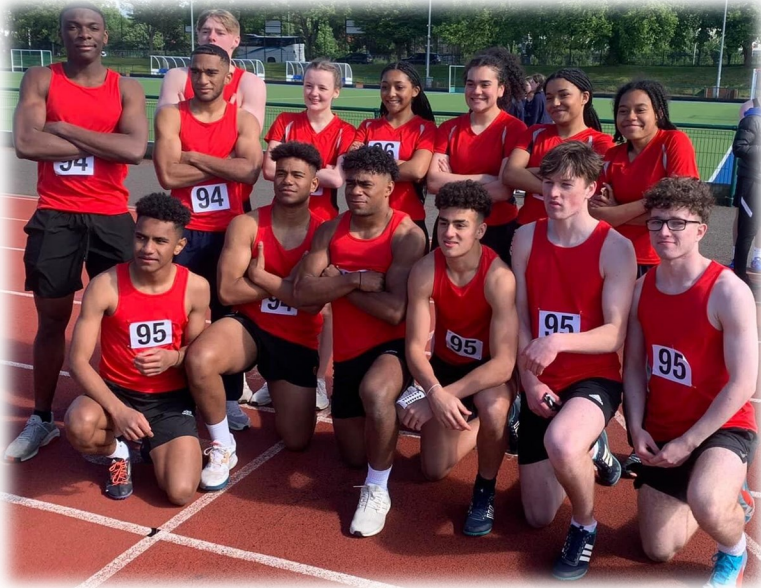
Well done to the teams in the Scottish Schools Relays. Our Gp B Girls won Scottish Schools Silver and the Boys Gp A and B teams both won Scottish Schools Bronze medals.