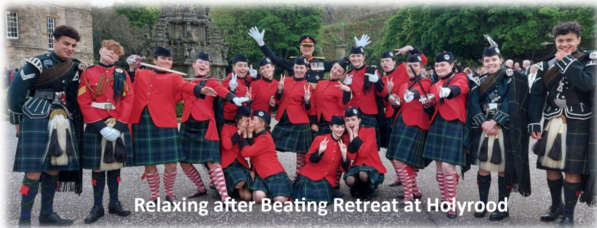
Relaxing after Beating Retreat at Holyrood