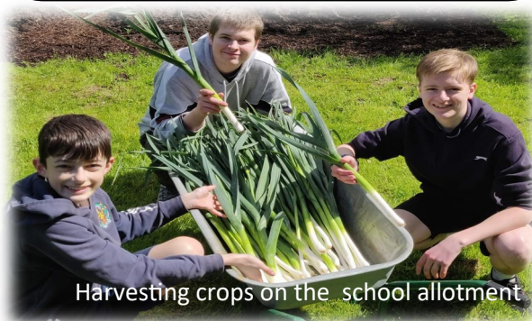
Harvesting crops on the school allotment

We do not have suitable facilities to accommodate the above on the school grounds.